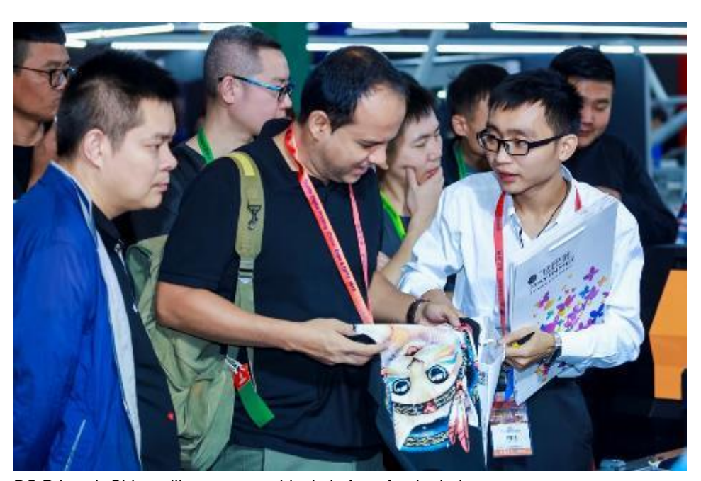
DS Printech China will serve as an ideal platform for the industry to reconnect

After months of effort in containing the coronavirus in the country, China is now eager to boost its manufacturing recovery. In the digital and screen printing sector, industry players are expecting the domestic demand to slowly pick up and, as such, nearly 200 domestic and overseas brands have already registered for their booths at the debut DS Printech China to capitalise on the post COVID-19 rebound, from 28 – 30 October 2020.