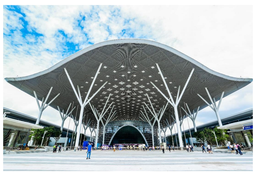
DS Printech China will open its door this week at the world's largest exhibition venue, Shenzhen World Exhibition & Convention Center

From 28 – 30 October, the inaugural DS Printech China will host around 200 exhibitors, representing over 400 brands, in hall 10 at the brand-new Shenzhen World Exhibition & Convention Center. The fair will feature an array of concurrent events to encourage the digital and screen printing industry to regather and recover from the worldwide COVID-19 pandemic. What's more, an online business platform is already live, offering a comprehensive range of sourcing options alongside the physical event.